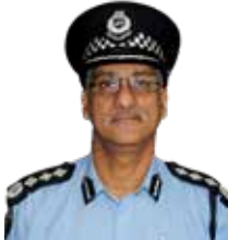
Joined the Force on 11.09.1981. Served in different Police Divisions including Rodrigues and Branches. Holds an LLB (Hons) from University of London. Attended the Royal Military Academy, Sandhurst, UK and Asia Pacific Center for Strategic Studies, Hawaii, USA.

I am pleased to present the Annual Operational Policing Plan for Traffic Branch for the year 2021.