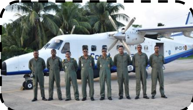
Crew of Mauritian Dornier Aircraft

Our National Coast Guard participated in the 7 th Cutlass Express Exercise held in Seychelles from 28 Jan to 08 Feb 2018. The exercise is carried out to assess and improve combined Maritime Law Enforcement Capability and to promote National and Regional Security in East Africa.