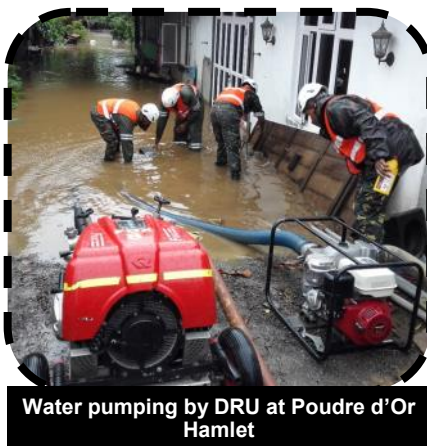
Water pumping by DRU at Poudre d'Or Hamlet

This year Mauritius has been facing an acute adverse climatic conditions. In February 2018 the country recorded an unprecedented amount of rainfall, the last of its kind being in the early 80's.