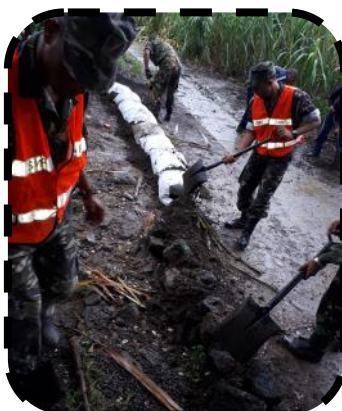
Sand bagging at Poste de Flacq