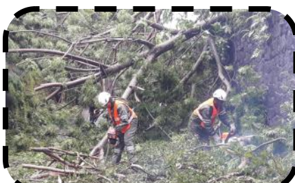
Tree cutting & Road clearance operation near Winners shopping complex at Vacoas

One important role of the SMF is to perform disaster rescue operations; its services is mainly required during the peak period of summer.