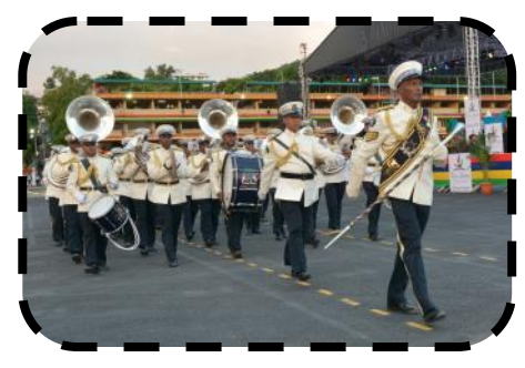
WPI Ramkissoon Police Press & Public Relation Office

and other guests. The smart turnout of all Police officers further embellished the bouquet.